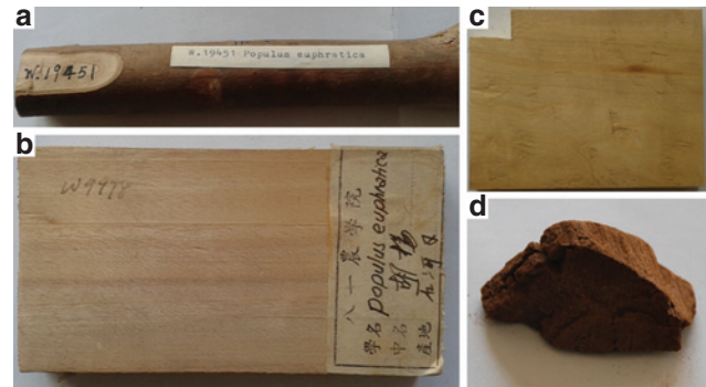
Figure 1 Aged and archaeological wood specimens of Populus euphratica . (a) w19451; (b) w9998; (c) w5314; (d) M70.

The exposed surfaces of the wood samples were removed with a sterile scalpel to avoid external contamination. The wood samples weighing 100–200 mg were ground into fine powders in a 6770 Freezer/Mill (Spex SamplePrep, Metuchen, NJ, USA) cooled by liquid nitrogen. All DNA isolations were carried out under sterile conditions. Wood DNA was extracted following the DNeasy Plant Mini Kit (Qiagen, Hilden, Germany) protocol with modifications (Rachmayanti et al. 2006; Jiao et al. 2014). Total DNA was subsequently quantified by 1% agarose gel electrophoresis and NanoDrop 8000 Spectrophotometer (Thermo Scientific, Waltham, MA, USA).