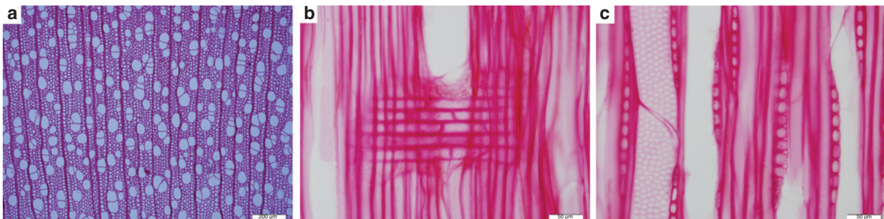
Figure 2 Wood anatomical features of Populus euphratica (xylarium w19451 as an example for illustration): (a) transverse section; (b) radial section; (c) tangential section. Scale bars, 200 µm (a) and 50 µm (b and c).

The mean values have been calculated from three DNA extractions of each wood specimen, respectively. Data in parentheses are SD. “–” indicates failed to be measured.