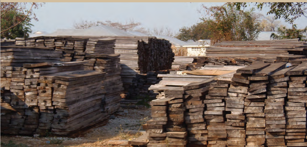
Seized planks of Pterocarpus angolensis and Afzelia quanzensis , suspected of being illegally imported from Mozambique. Tanzania Revenue Authority border post at Mtambaswala, Mtwara Region, September 2015.

DOMESTIC CONSUMPTION OF NATURAL FOREST TIMBER IN THE REGION IS ESTIMATED TO AMOUNT TO MORE THAN TEN TIMES BY VOLUME THE AMOUNT OF TIMBER EXPORTED INTERNATIONALLY